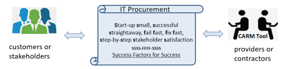
Figure 2 Conceptual view of the method for DGT road map implementation (4S4F4SFactors for success)

The method is, here, described as start-up small , successful straightaway , and fail fast , fix fast and step-by-step stake - holder satisfaction ( SSSS-FFFF-SSSS ), shortened to 4S4F4S, as the guiding principle for digital government transformation.