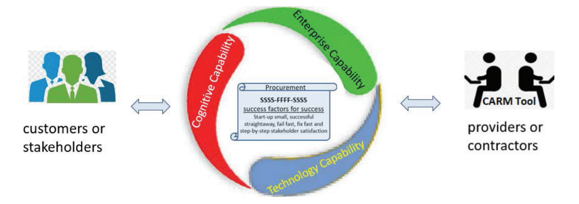
Figure 3 The method for implementation of DGT enables 3 capabilities' development within the government enterprise